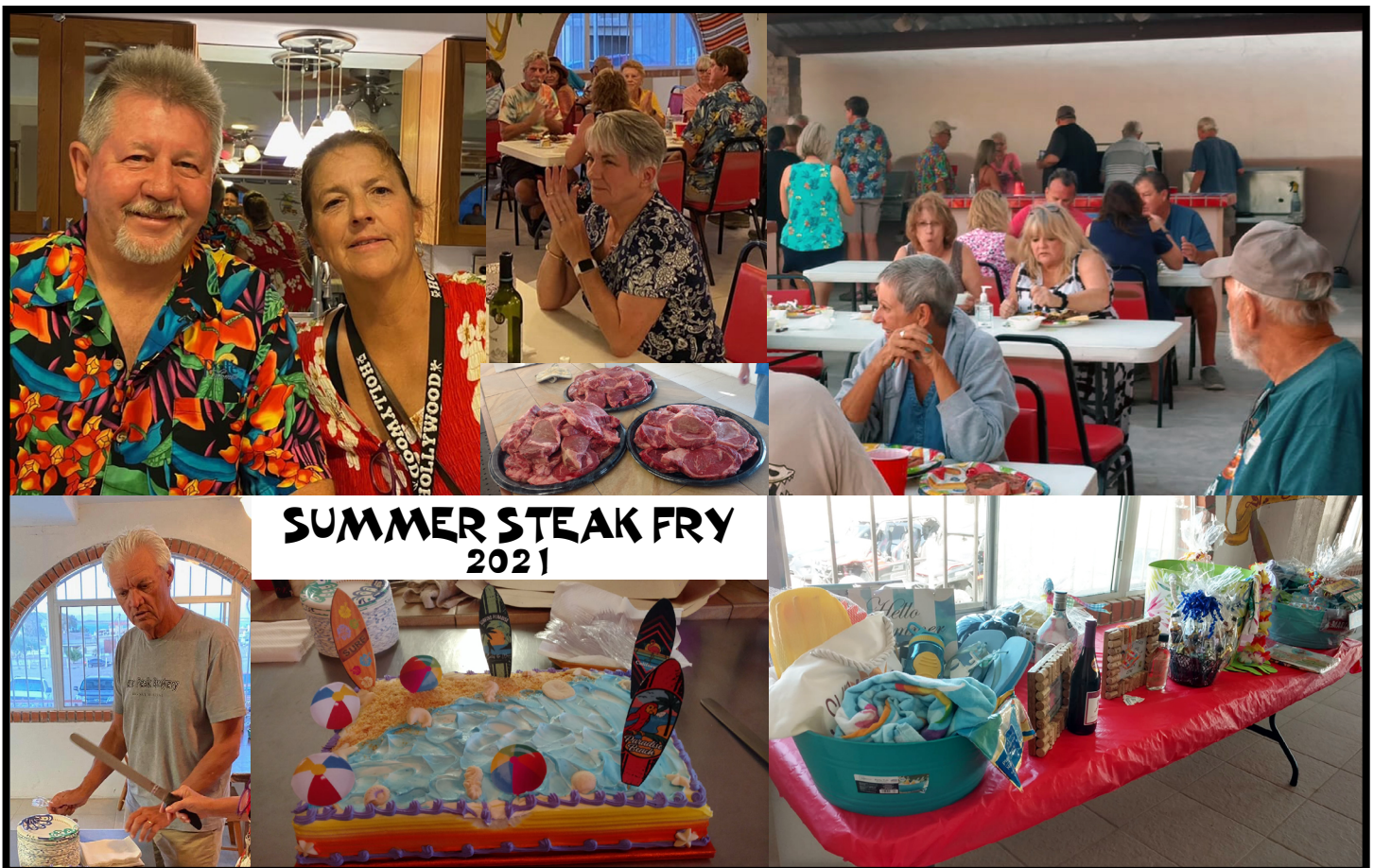
SUMMER STEAK FRY 2021