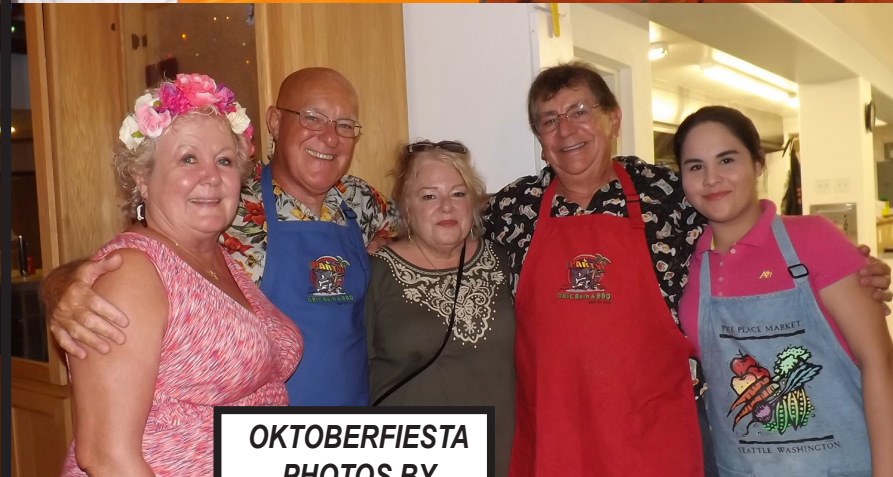
OKTOBERFIESTA